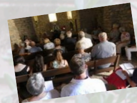
Summer Service at Roquessels