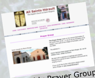
Monthly Prayer Group