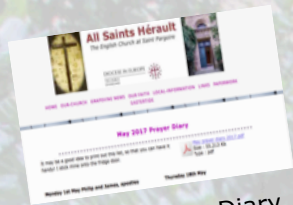
Monthly Prayer Diary