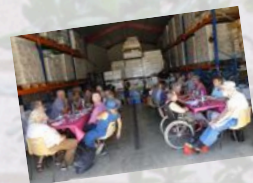
Shared Lunch after Service at Roquessels