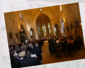
Fontès Carol Service