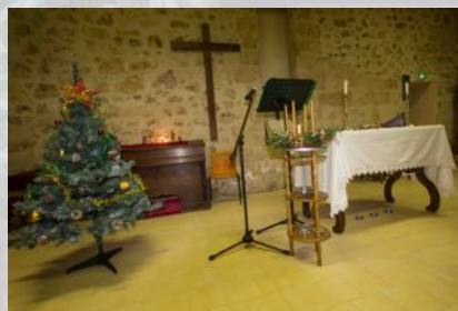
Church at Christmas

We welcome your feedback, whether it is positive or not, along with any ideas which you feel will benefit the church or it's members. Please use the church email address to pass on your thoughts (achstp@gmail.com) or speak to one of the above persons