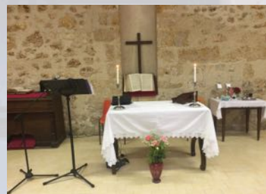
Church at Easter