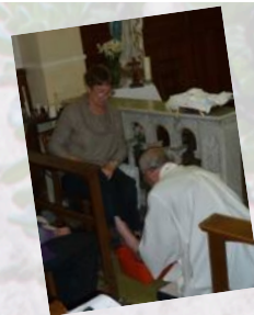
Washing of Feet during Maundy Thursday Service