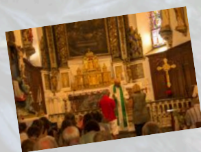
Service in the chapel at Margon