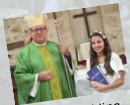
Bishop presiding over Confirmation Service