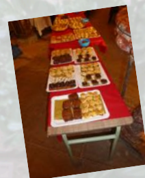
Mince pies after Carol Service